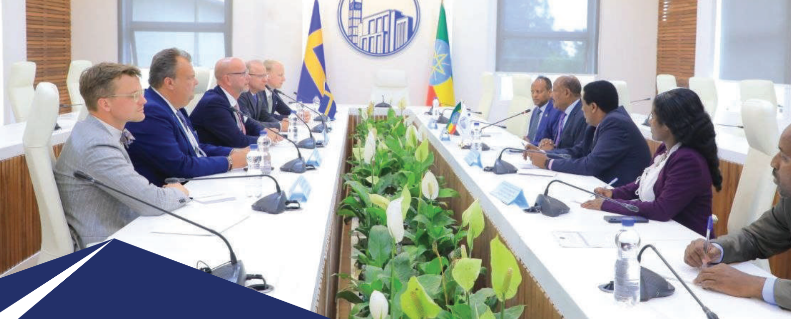
When the Foreign Relations and Peace Affairs Standing Committee of the HoPR received and held discussions with the Ethio-Sweden Parliamentary Friendship Group.

They reportedly told their Ethiopian counterparts that they had witnessed firsthand, during their visits to various parts of the country, that Ethiopia is on a path of rapid growth and change, is a tourist-friendly country, and that its people are hospitable, respectful, and tolerant.