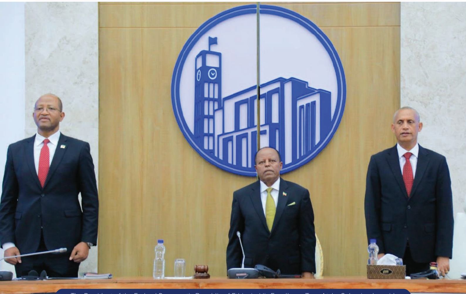
The President of the Federal Democratic Republic of Ethiopia, His Excellency Taye Atske Selassie, alongside the Speakers of the two Federal Houses of Parliament, Honorable Tagesse Chafo (House of Peoples' Representatives) and Honorable Agegnehu Teshager (House of Federation)

Accordingly, at the opening ceremony of the 5 th year of his term of office, the President of the Federal Republic of Ethiopia, His Excellency Taye Atsek Selassie, announced that the two Houses of the federal government had commenced their annual work and presented the annual plan of the federal government on Monday, September 26, 2018. Bridge summarized the main points he made in his opening speech as follows .